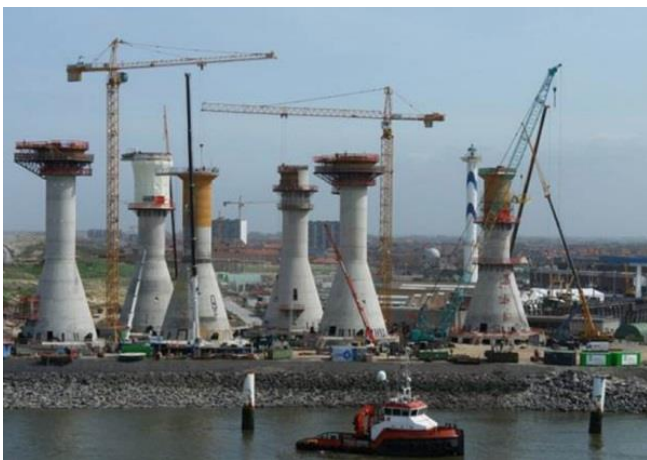
Fig. 4. Construction of supports on the quayside (Ruiz de Temino Alonso, 2013)