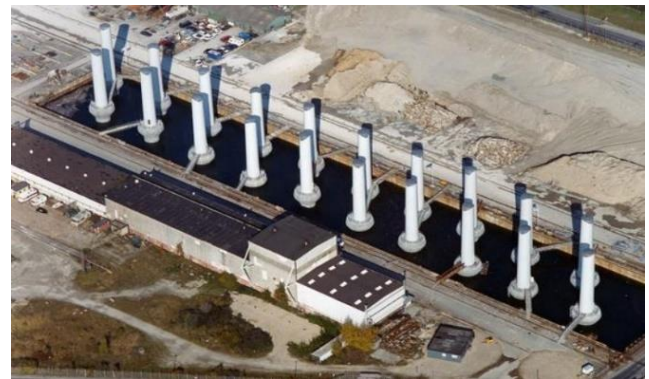
Fig. 2. Construction of supports in dry dock (Ruiz de Temino Alonso, 2013)

The supports of the gravity-based structure can be categorized into three generations and each generation can be constructed in a different place. The dry dock is the first place where the construction of supports can occur and it is used in the first generation of gravity-based structures. The dry dock is flooded when the supports are ready to be floated out Fig.2. Floating pontoons is another place where the construction of supports can occur in which the supports are constructed on semisubmersible barge or floating pontoons and it is used in the second generation.