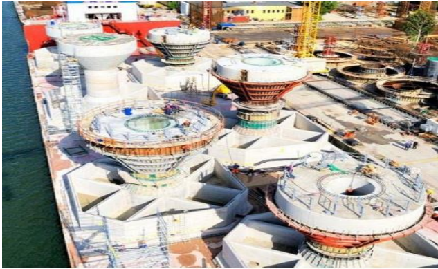
Fig. 3. Construction of supports on semisubmersible barge (Ruiz de Temino Alonso, 2013)