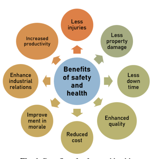
Fig. 1. Benefits of safety and health

In general, there are several benefits for safety and health across all industries, and especially in the construction one. The important benefits of safety and health are illustrated in Fig. 1.